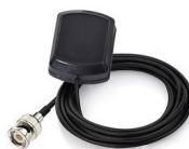
Standard GPS antenna Terminated with 5 meters of RG174 coaxial cable

All Quartzlock GPS frequency references are supplied with our standard GPS Antenna, Manual, Test sheet, Calibration certificate and Certificate of conformance. The standard GPS antenna has 28dB gain sufficient to provide strong GPS signal to main GPS reference unit when placed near a window or mounted outdoor.