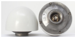
High Gain GPS antenna

The High Gain GPS Antenna is designed for stationary application and all weather and harsh environment to provide a strong signal. This antenna is also a high-quality solution for adding GPS RF signals to marine GPS navigation systems. The high gain GPS antenna can be setup with up to 70 meters of cable. The high gain GPS antenna is supplied with stainless steel antenna mount.