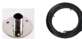
Antenna mount & coaxial cable

Waterproof, weatherproof Operating Temp -40°C to +85°C Gain: 35dB ±3dB Voltage: +5V Connector: TNC L1 GPS, 1575.42MHz ±1.023MHz ROHS compliant